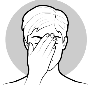
Hiding your face