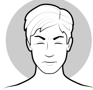
Forcing your eyes shut