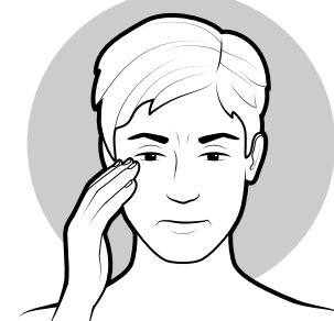
Touching your eyes