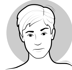
Making sudden, jerky moves