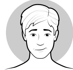
Quivering of lip