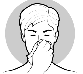
Blowing your nose